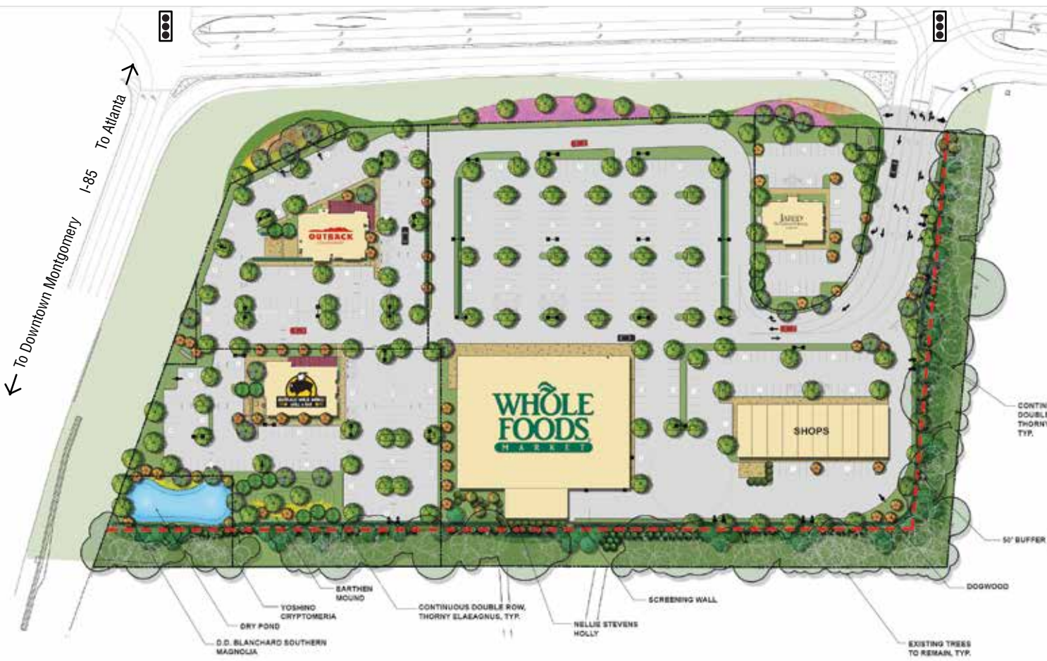
Eastchase Lifestyle Center

Dining District Synergy: Bonefish Grill, Red Robin, Texas Roadhouse, Applebee's, Chili's, Jim N Nick's, Ruby Tuesday, Cracker Barrel, Mughshots, Mellow Mushroom, Panera Bread, Five Guys, Zoe's, Genghis Grill, Chick fil A, Zaxby's, Salsarita's, Starbucks (2), Firebirds, Chipotle, Taziki's, Del Taco, Newks and numerous other quick serve foods and popular local eateries.