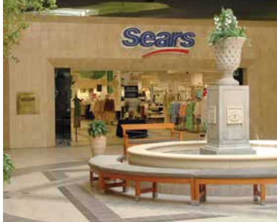
All Department Store Anchors serving Montgomery are represented under one roof at Eastdale Mall